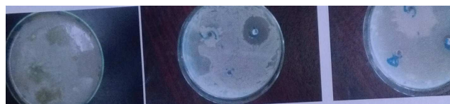
Figure 3. Inhibition activities of Actinomycete isolates against test organisms.

determined by giant colony technique is shown in Figure 3. In giant colony technique, three isolates showed antibacterial activity. Comparatively, S. aureus was highly sensitive than other bacteria; E. coli showed resistance against the actinomycete tested. The results are tabulated in Table 2.