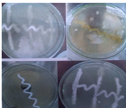
Figure 2. Actinomycetes isolated on SCA medium using streak plating technique.

The actinobacteria isolates were subjected to morphological and gram staining. Table 1 represents the morphological characteristics of the Actinomycetes isolates as studied by colony characterization (color) and Gram staining.