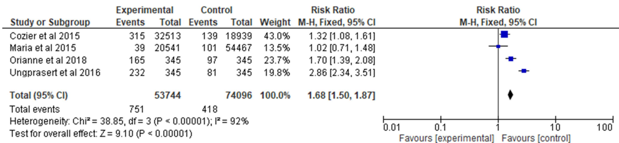
Figure 2. Meta-analysis results.

the variation in effect estimates is not by chance.